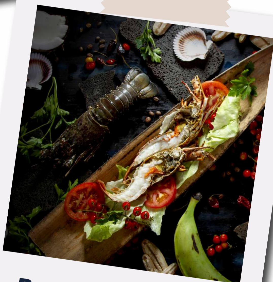
Bounty of the Ocean