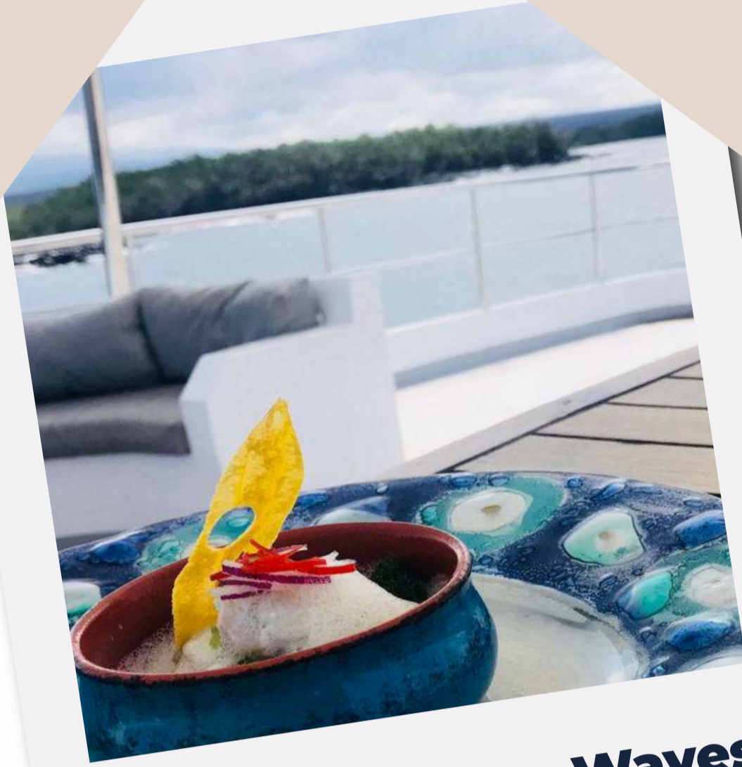
Cruises' Culinary Waves