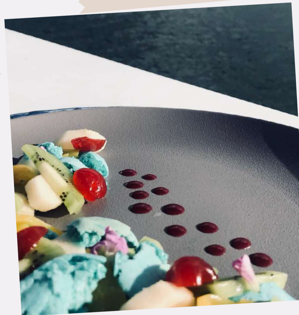
Innovation Meets Tradition